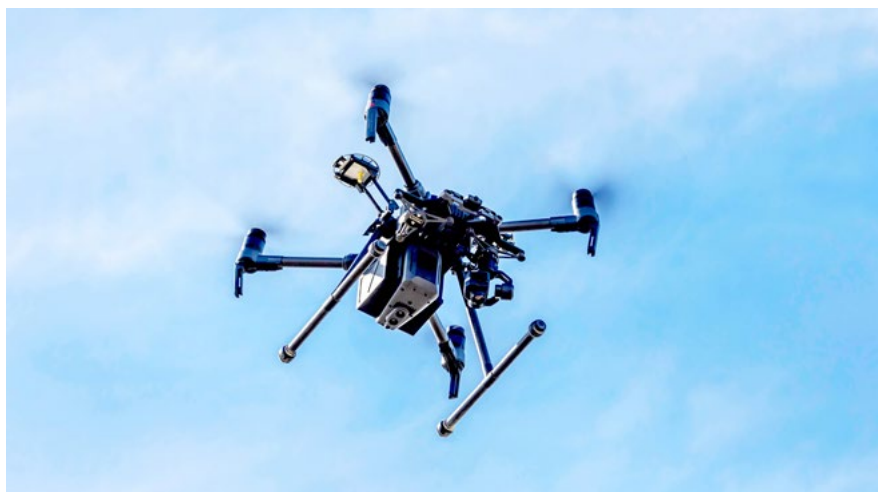
UAV flying in the sky

Once a flight was approved, it was manually added to a central spreadsheet. Unfortunately, this didn’t give the team the visibility it needed.