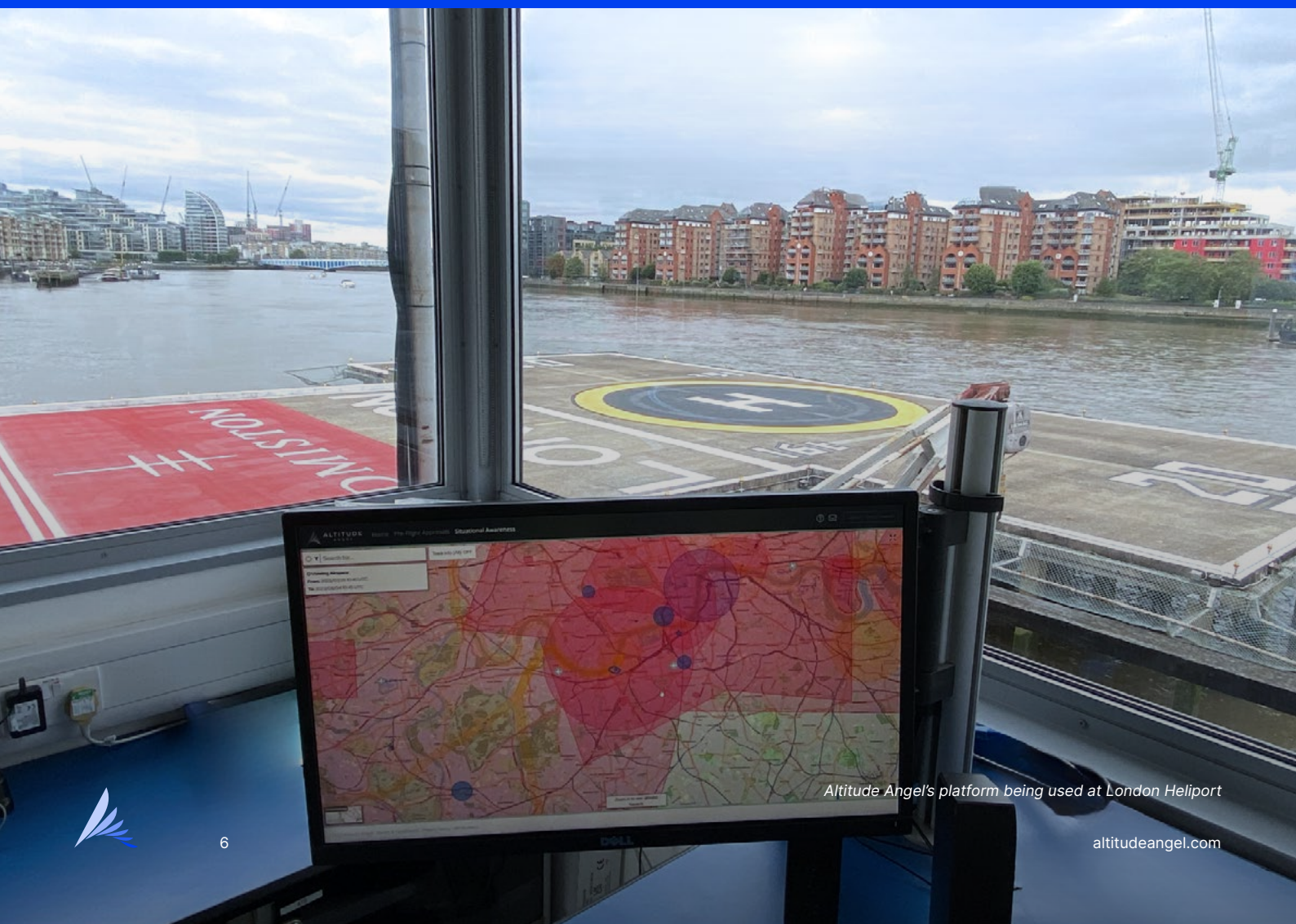
Altitude Angel's platform being used at London Heliport